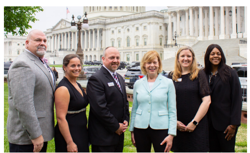
Sen. Tammy Baldwin (D-WI) at ACEP's Workplace Violence Prevention Press Event