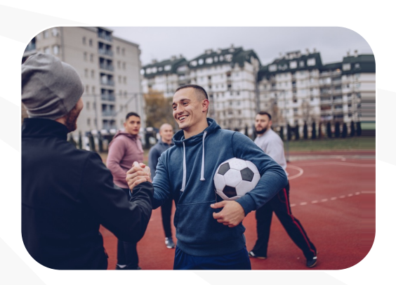
Population Health & Lifestyle Medicine