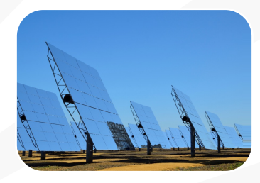
Climate & Energy