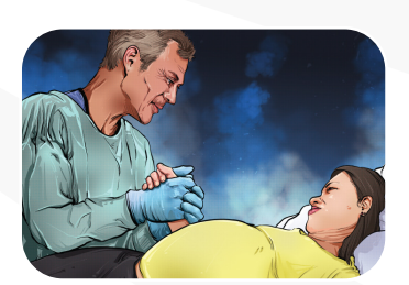
Women's Reproductive Health