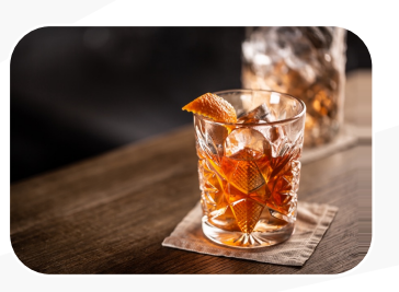
EM Bourbon Summit